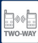
Two Way Radio