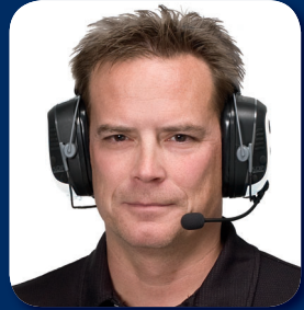
Behind the Neck (BTN) Product Code SMESDPSR