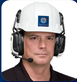
Helmet Mount (HM) Product Code SMHSDPSR