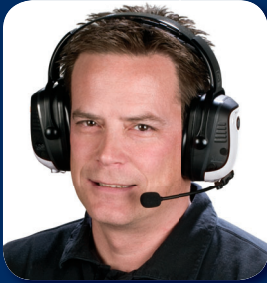
Headband (HB) Product Code SMSDPSR1