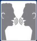
Face to Face