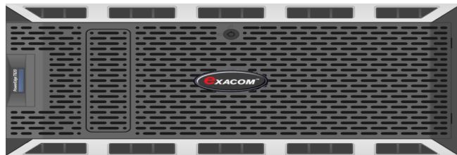
Featuring "Hindsight-G2™" Multi-Media Logging Recorder Powered by Dell "PowerEdge" T630 Server Expandable to 360 Channels

NG911/P25 Ready: Audio, Video & Data Recording in One Recorder (Powered by Dell "PowerEdge" T630 Server Expandable to 360 Channels)